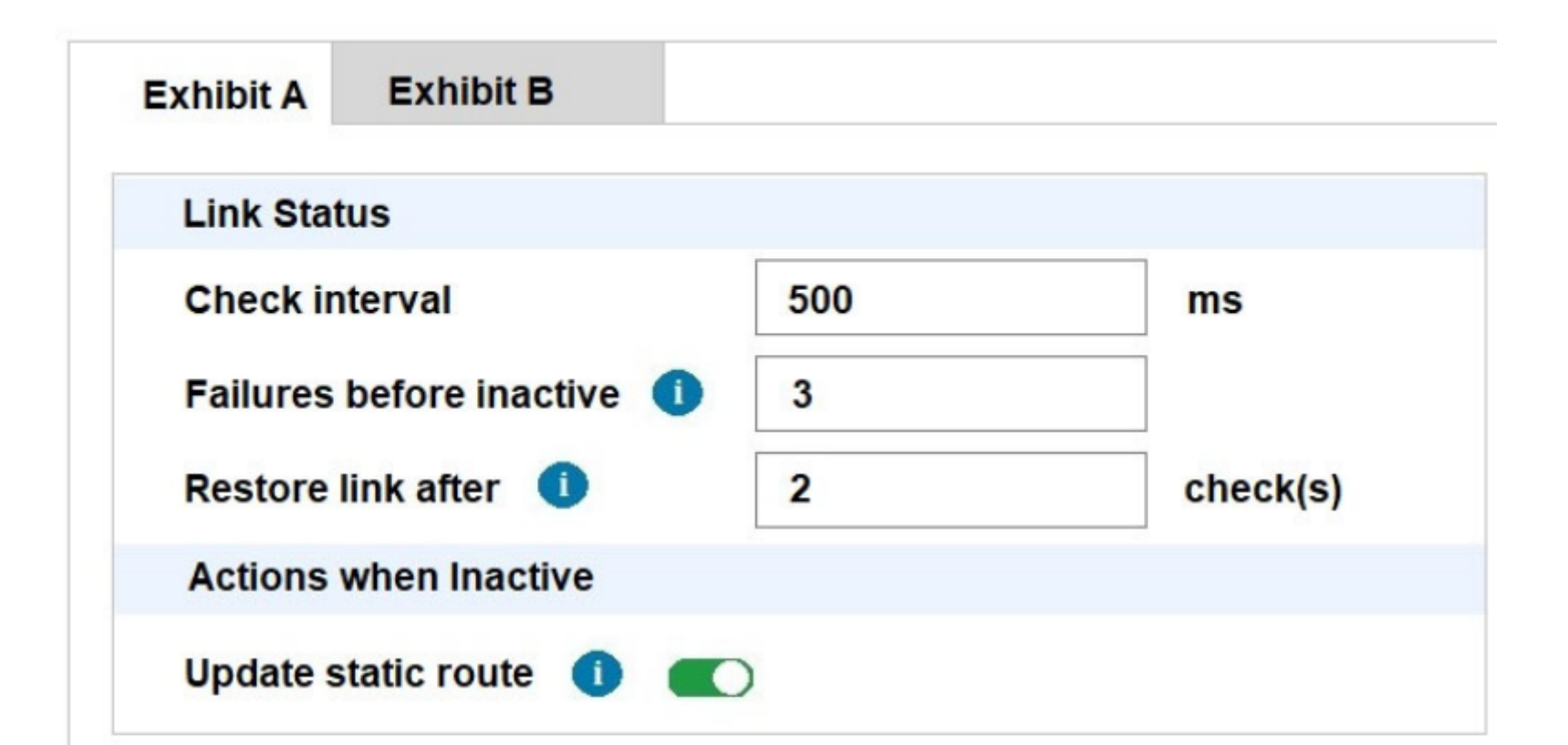
Exhibit A Exhibit B